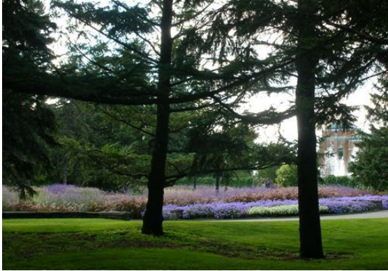
A wash of purple blooms seen through the trees, at the Quebec Botanical Garden.