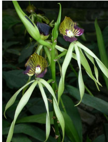
Orchidoides squidii, squid orchids fit for a mermaid's garden