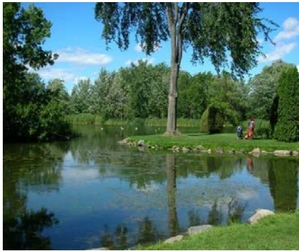
Overviews of the sprawling botanical garden near the Olympic Stadium.