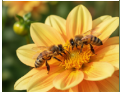
The Bee Lives Less Than 40 Days, Visits At Least 1000 Flowers And Produces Less Than A Teaspoon Of Honey. For Us It Is Only A Teaspoon Of Honey, But For The Bee It Is A Life. Thank You, Bees

financial health and happiness of the club, you must submit receipts whenever you use club funds. If you need help, ask a board member. All Special Administrators have been assigned to a board member who is available to assist them. Remember, any expense over $300 needs prior approval from the board. Thank you!